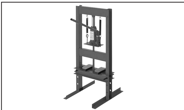
Figure 1. Model H2870.